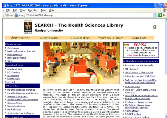
A view of library microsite of Health Sciences Library, KMC, MU, Manipal

3.1.1.7. Bibliographic databases: This icon gives link to PubMed/MEDLINE; PubMed Search – Online Training; Medline Plus; Other Bibliographical Databases like HighWire Press Journals/Articles Search, MetaPress Journals/Articles Search, Ingentaconnect Journals/Articles Search, SpringerLink Journals/Articles Search, Cambridge Journals Online, Union Catalogue & Gateway to library catalogues; IndMED; OpenMED, etc.