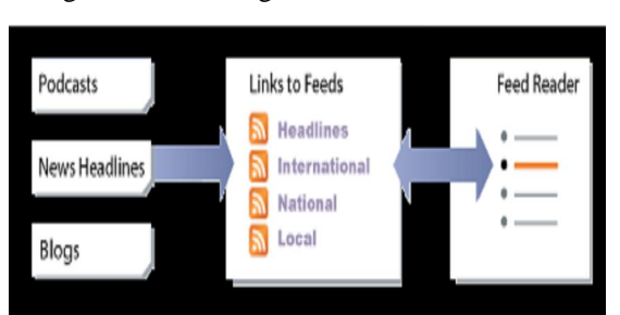
Figure 2 - Application of Web Feeds

doing this is usually as simple as dragging the link from the web browser to the aggregator. When instructed, the aggregator asks all the servers in its feed list if they have new content; if so, the aggregator either makes a note of the new content or downloads it. Aggregators can be scheduled to check for new content periodically. The kinds of content delivered by a web feed are typically HTML or links to webpages and other kinds of digital media. Often when websites provide web feeds to notify users of content updates, they only include summaries in the web feed rather than the full content itself. More advanced methods of aggregating feeds are provided via WebTops that are based on AJAX coding techniques and XML components known as Web widgets. WebTops are personalized services which provide a roaming desktop that can host all of user's most common Web information such as emails, news, RSS/Atom feeds, Calendar, etc. Some modern web browsers incorporate aggregator features. Safari, Firefox, Internet Explorer 7.0, and many other web browsers allow receipts of feeds from the tool bar using Live Bookmarks, Favorites, and other techniques to integrate feed reading into a browser.